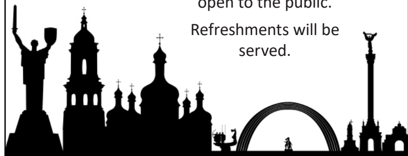
Illustration credit: Sasha Krut